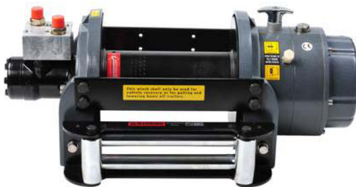
PN 686732 STD DRUM